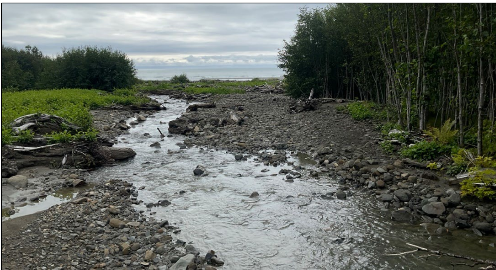
Figure 3.—Looking downstream and waypoint 1124.