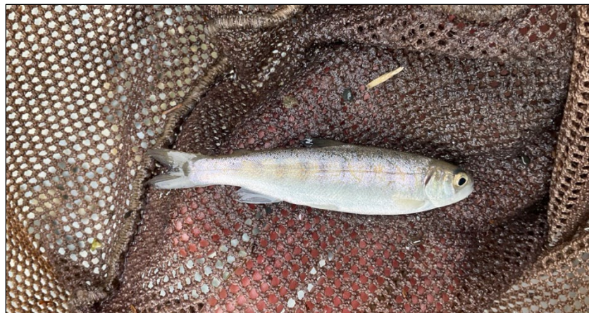
Figure 1.–Juvenile coho salmon caught at waypoint 1126.