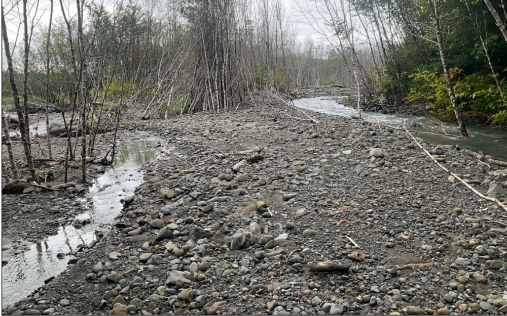
Figure 2.—Looking downstream at waypoint 1125.